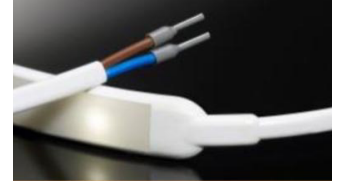
IP68 Connector (Horizontal)