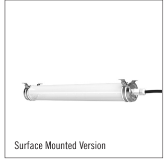
Surface Mounted Version